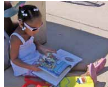
Mothers are encouraged to read to their children and take them to visit the local library.