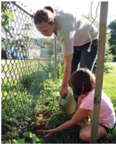
Growth is an important aspect for all of Bridge of Hope—for families, mentors, staff, and board members.

James Hale Steinman Foundation Adams Sterge Family Fund of The Philadelphia Foundation Margaret Dorrance Strawbridge Foundation of PA 1 Inc. TD Charitable Foundation Tres Foundation, a fund of the Chester County Community Foundation Vanguard Charitable Endowment Program Verizon Foundation Willistown Friends Meeting Trust